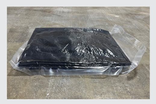
Remove Minnow Bags From Vacuum Sealed Pouch