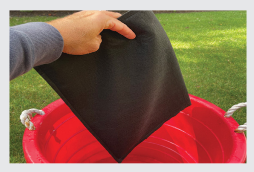
Place Minnow Bags in Fresh Water Pool For Inflation