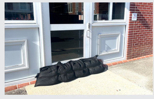
Continue to Add Rows & Layers as Needed