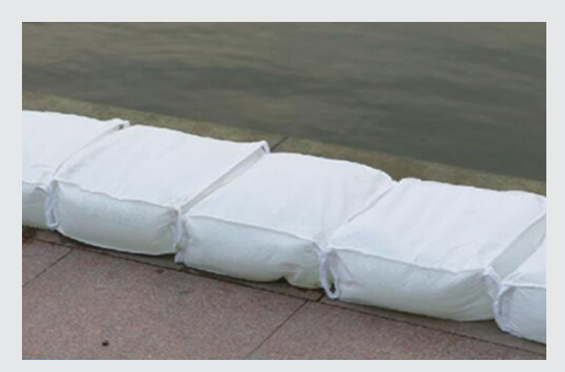
Place First Row of Bags Down, With the Long Side Parallel to Water