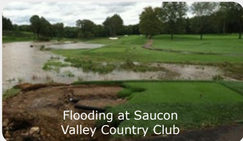
Flooding at Saucon Valley Country Club

600ft of Mayim MB2 Barriers positioned along the creek whenever heavy rainfall is expected.